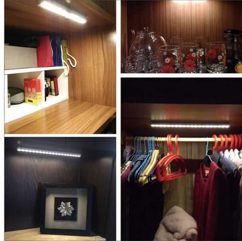
motion-sensor lights Battery cabinet light